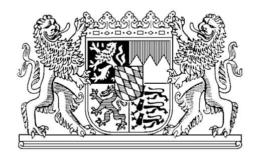
TUM-19503 Februar 1995