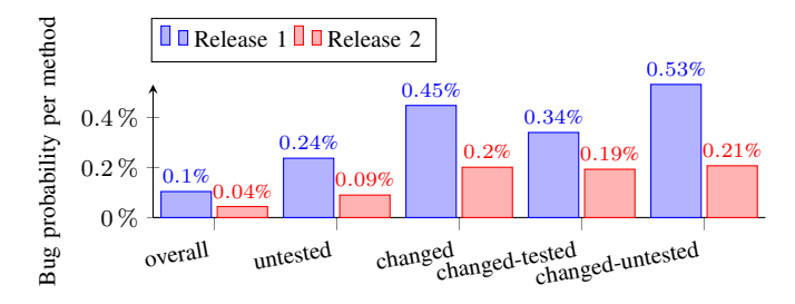
Fig. 3. Probability of fixes in both releases

Study Execution: We used tool support, which consists of three parts: An ephemeral [18] profiler that records which methods were called within a certain time interval, a database that stores information about the system under consideration,